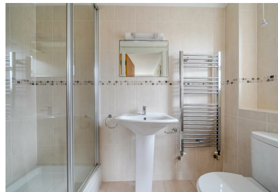
*FIRST FLOOR APARTMENT CLOSE TO BURLINGTON CHINE BEACH*

Welcome to Burlington Place. This delightful apartment building is situated just a stone's throw from Burlington Chine beach and a short, scenic walk to Swanage town centre. We are pleased to present to the market a wonderful two bedroom apartment in Burlington Place, which boasts two large double bedrooms with fitted wardrobes, allocated parking, visitor space, and well-manicured communal gardens to enjoy. This versatile apartment is offered to the market with no forward chain and presents a great opportunity to acquire an investment property, holiday let, holiday home or first time purchase.